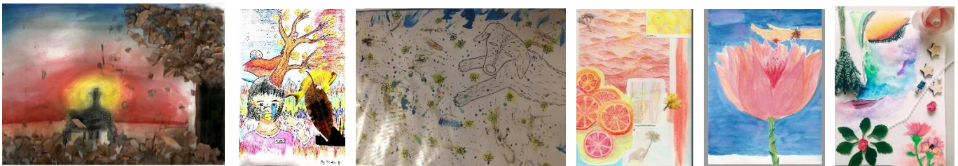
Seasons – mixed media creations by S3

Art enlarges our knowledge of and insight into the surrounding world by giving shape to the important outer and inner characteristics of this world. Through a process of exploration and organisation, art fosters our power to imagine, and our ability to represent experiences, feelings, ideas and opinions. This perception and interpretation enables us to create personal images and objects.