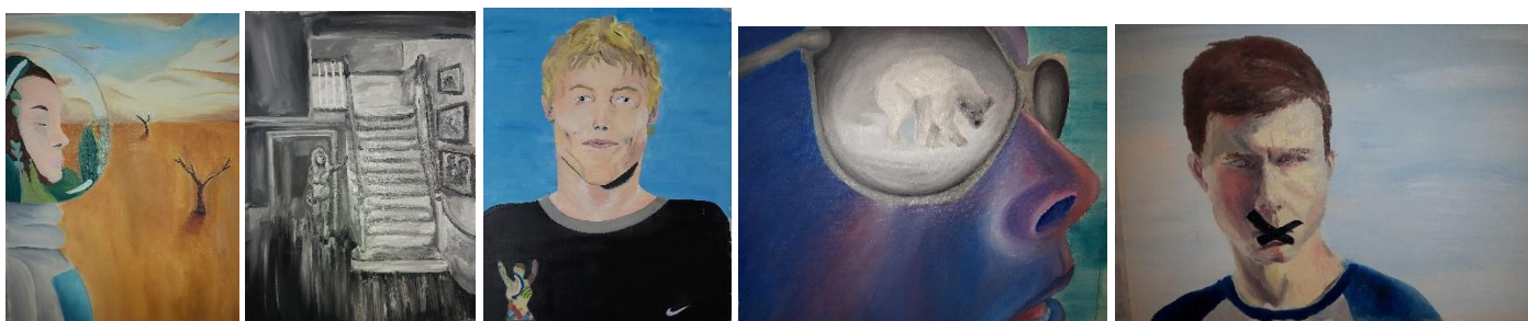
“Surroundings” Btest People & Places bac theme S7 Art option/ Bac Art Exam “Art & Animal” Bac theme 2019