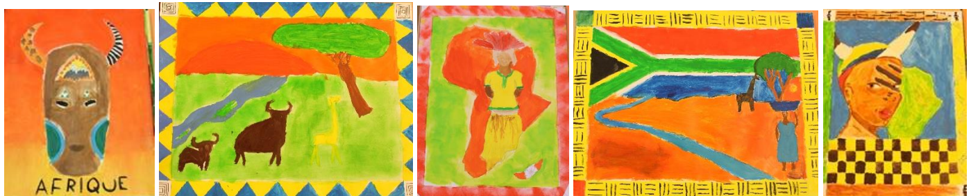
Africa posters in relation with English Literature S2" Journey to Jo'burg"

Art develops creative and lateral thinking in all areas in which the pupils choose to work and this competence has an impact in all subjects taught in school. Art class work is organised in projects that usually have a visual product. This fosters the student's ability to work with independence and responsibility.