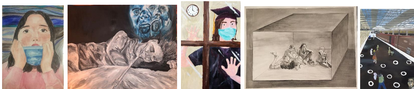
“Life after Covid 19” creations by S7 Art option students- May 2020

In the 4-period option the student is prepared for the practical baccalaureate exam in art which includes research, preparation and critical reflection. The nature of this exam determines the way class work should be organised.