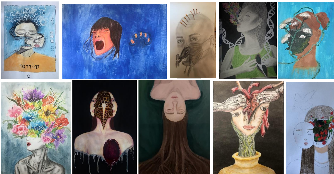
« Beneath the Surface » paintings by S5 option Art students.

In S4 and S5 it is assumed that the students have acquired these skills and can now be given more room to experiment, explore and develop their own solutions with less guidance from the teacher. They must learn how to document and present this development process as part of their solution. This approach will require more personal responsibility and autonomy of the students and should enable them to achieve their full potential.