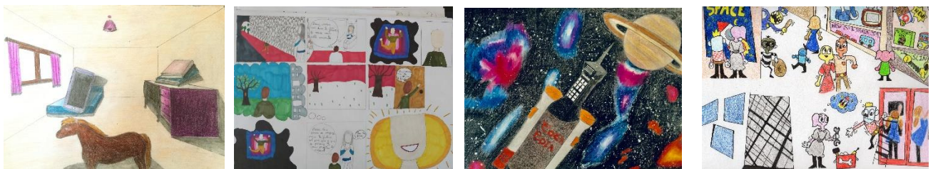
Art and Narration: Comic-strip; Stop Motion: Time Travel project S2

With the development of modern media, images have gained even more importance. Since they are omnipresent and quickly available, they are capable of having a major 2016-08-D-1-en-3 4/29 impact on our understanding of the world. Therefore, it is necessary to comprehend the implications of their influence with critical awareness and to bring this awareness to consciousness in the teaching situation. Practical and theoretical work in the art class is done on the basis of communication and tolerance and supports an education whose aim are free, active and social persons.