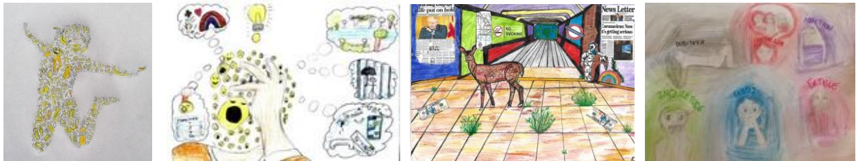
Confinement: Emotions, body language and Colour : Drawings by S1

The subject Art in the European schools means The Visual Arts . Visual arts contain the complex process of perception, reflection and interpretation of the world around us and result in the creation of images. This process and the resulting products are the main working areas of the subject art.