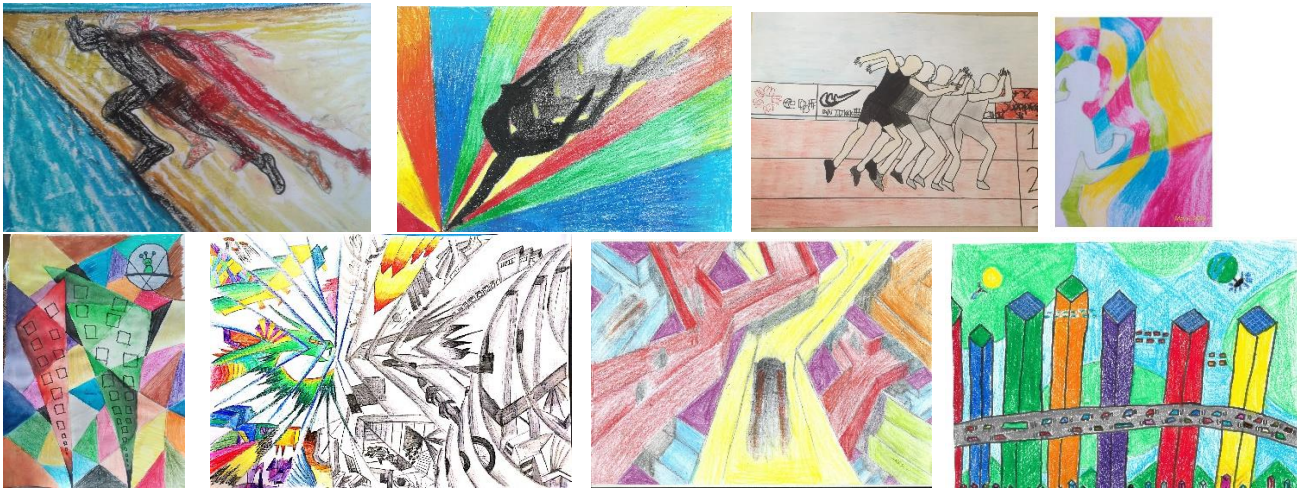
Italian Futurists inspired Movement drawings S3 & "City of Tomorrow" S3

Art enlarges our knowledge of and insight into the surrounding world by giving shape to the important outer and inner characteristics of this world. Through a process of exploration and organisation, art fosters our power to imagine, and our ability to represent experiences, feelings, ideas and opinions. This perception and interpretation enables us to create personal images and objects.